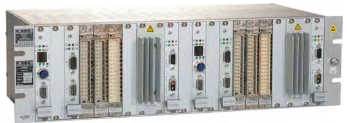
EKE-Trainnet® System including the Lateral Acceleration Monitoring System and Hot Axle Box Detection System