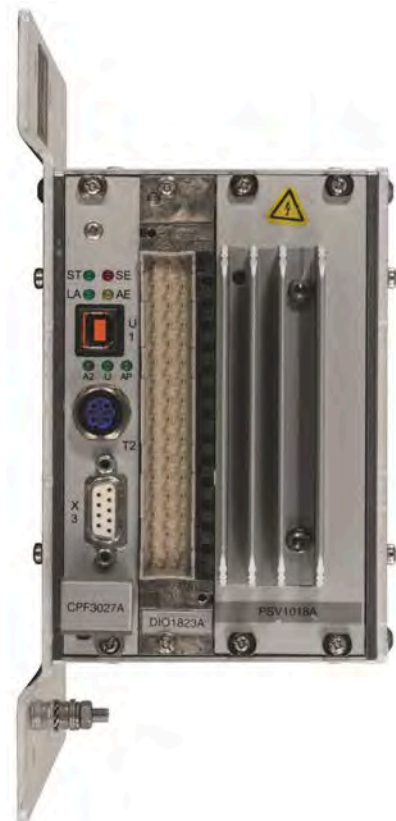
Vigilance Control System in flat rack with CAN interface module and extra logging memory