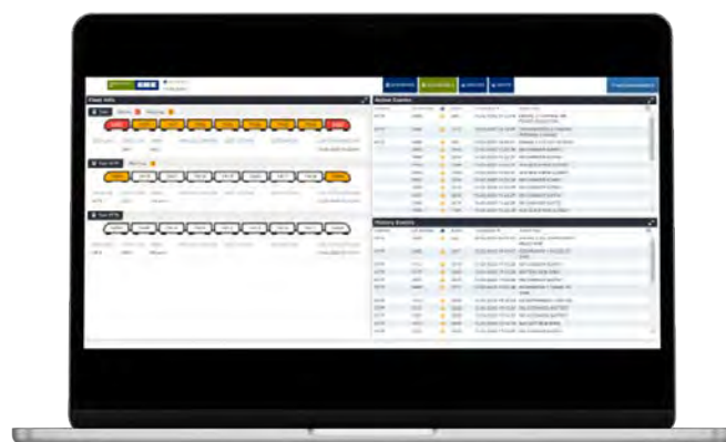
Example of SmartVision™ Train Condition Monitoring user interface showing train status