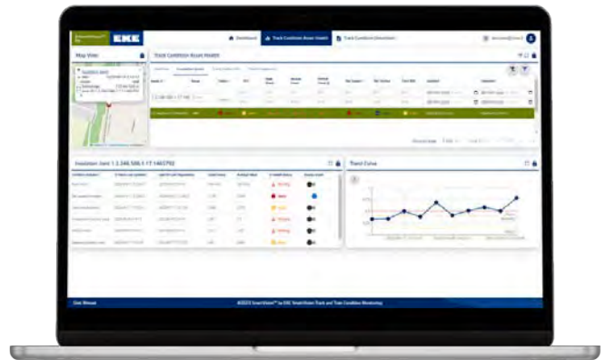
Example of SmartVision™ Track Condition Monitoring user interface showing asset health for predictive maintenance