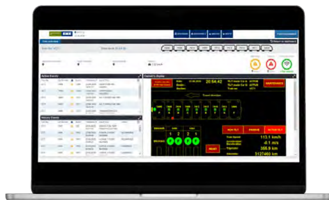
Example of SmartVision™ Train Condition Monitoring with driver's display